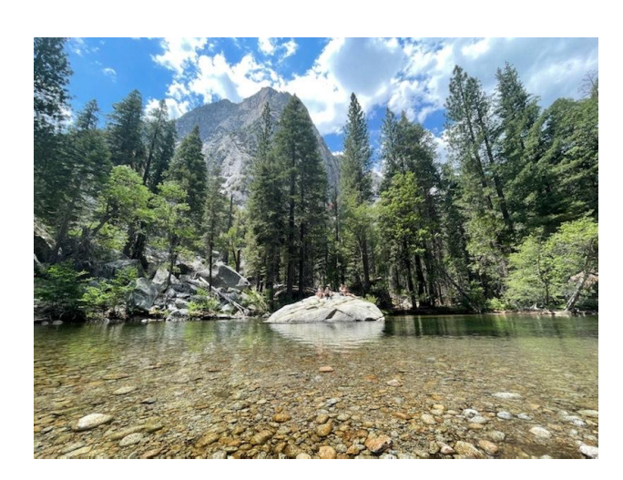
A view of the Kings River from a camping trip to Kings Canyon National Park. (Sara Volle)