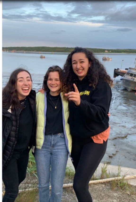
FRIENDSHIPS IN UNEXPECTED PLACES