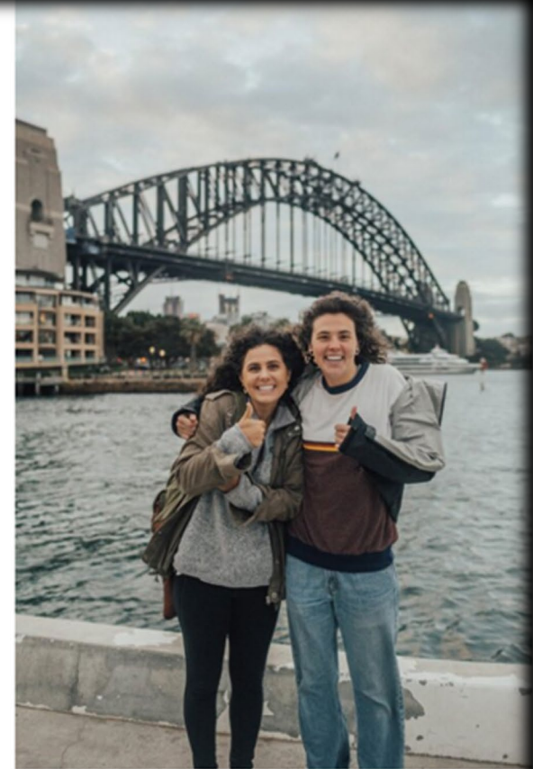
BLOOD, FISH AND FAMILY