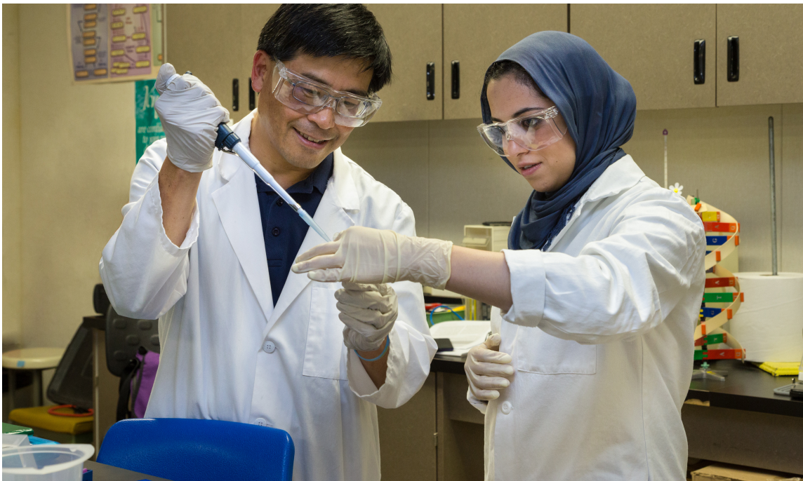
An American River College student and her instructor in the lab.

In May 2009, the California Community Colleges Board of Governors approved changes to California Code of Regulations, title 5, §53407 and §53410 to allow the creation of a third option within the minimum qualifications to be defined requiring a bachelor's or associate degree in a specific discipline, plus requisite years of professional experience. The four types of discipline lists contained in this handbook are identified on the opposite page.